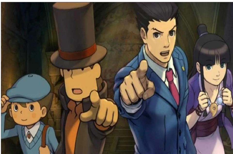
Professeur Layton Vs Phoenix Wright ©

ON 29 JANUARY – 2 FEBRUARY THE LET'S PLAY GREENER TEAM IS HOLDING